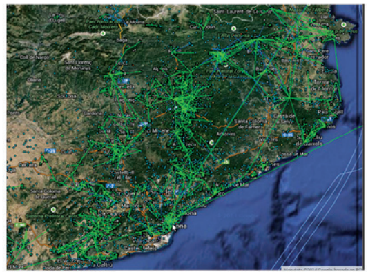
Figure 9.1. Comparison: economic transactions using Sardex.net in Sardinia, Italy (reproduced from losifides et al. 2015) and guifi.net network graph sector around Barcelona, Spain.

Similarly to guifi.net, Sardex.net is a very successful complementary currency in Sardinia, Italy, founded in 2009 (Littera et al. , 2017; Posnett, 2015). Figure 1 depicts two popular graphs of the two networks. The graphs might look similar, but in reality, they represent two different communication layers. The Sardex.net graph corresponds to the actual transactions between members of the Sardex.net network that are limited only by demand-supply relationships. The guifi.net graph corresponds to the communications network, the network infrastructure itself, which is limited by the geography and equipment costs, and thus results in a more structured network with "highways" and "low traffic roads". However, like in Sardex.net, the guifi.net network allows the implementation of a wide variety of services that could mediate interactions between any set of nodes.<sup>204</sup>